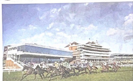
Newbury is one of many courses in Britain to have suffered a drop-off in general admissions

A record crowd of more than 400,000 people attended the three-day British Grand Prix,